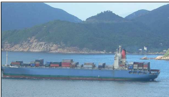
MOL Glory