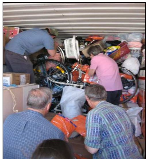
Mission Shed workers packing the Israel container

A second truckload of furniture was driven to Sderot. A Welfare official requested it for families that are in financial woes in the city, due to the lack of business in the city. Our aid centres also received this distribution -- pallets of furniture like headboards and small bookcases, chairs, desks, etc. These will mostly be distributed to Russian Jewish immigrants.