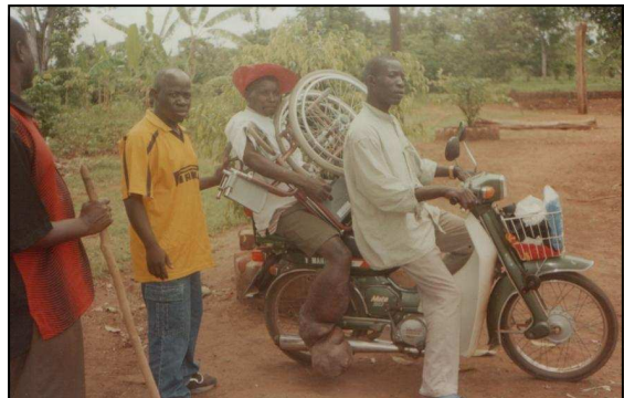
Ugandan man who lives with the disability called elephantiasis is on the back of the bike holding his new wheelchair!