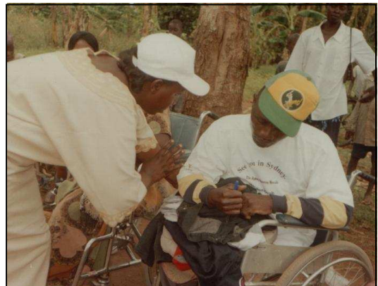
Wheelchair supplied by MWA