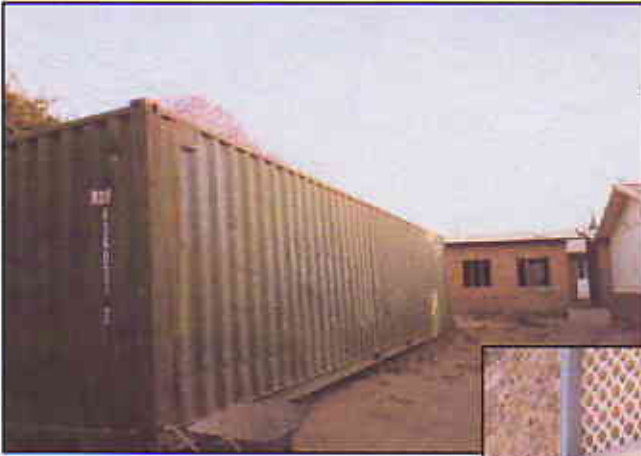
Parked container Mbeya, Tanzania