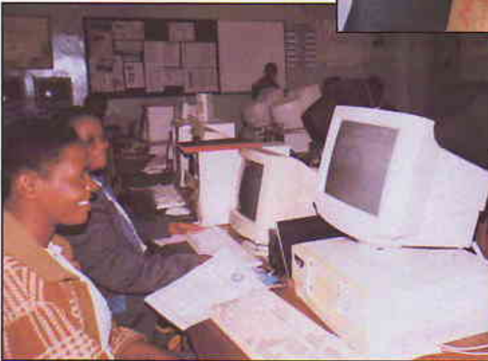
Computers from the container being put to use.