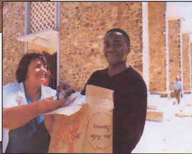
A doctor from a local hospital receiving bandages sent in the container.