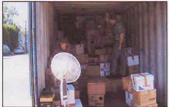
A fan being used to bring some relief from the searing heat while packing a container.

On March 10 we will pack a forty footer for IT Share who have generously supplied us with re-conditioned computers to send to many destinations.