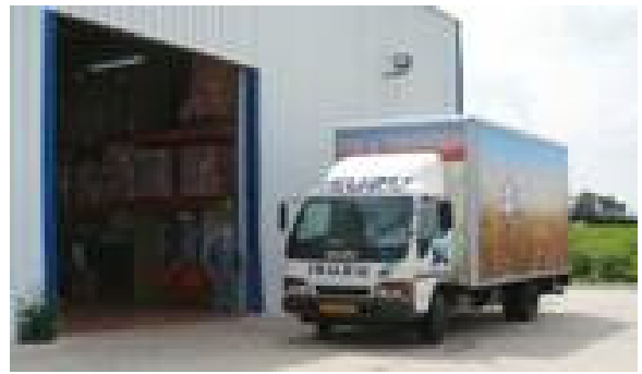
Truck at the Joseph Project's huge warehouse

We have also received remarkable feedback concerning the many rolls of wallpaper we sent which were used on glassless windows of homes in Jericho to keep the snakes out!