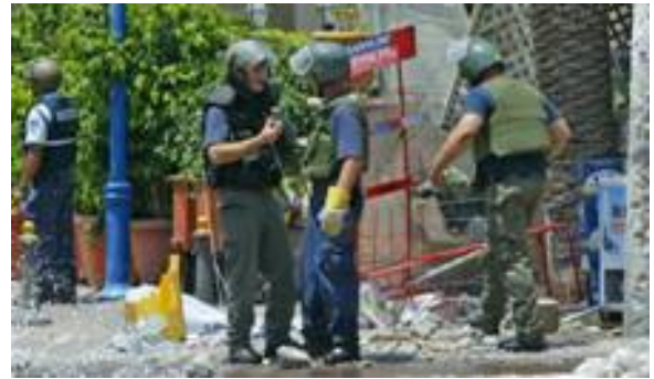
Israeli firemen with MWA sweatshirts

Visit our website: www.missionworldaid.org