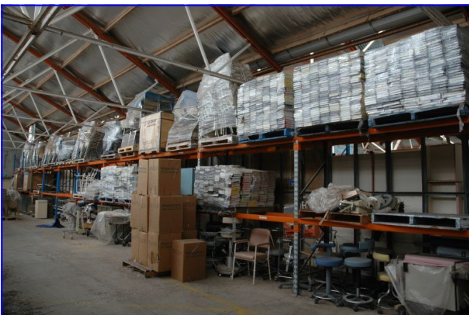
Scenes inside the warehouse