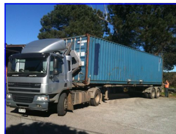
Another container being delivered at the Mission Shed. This one is for Kenya.