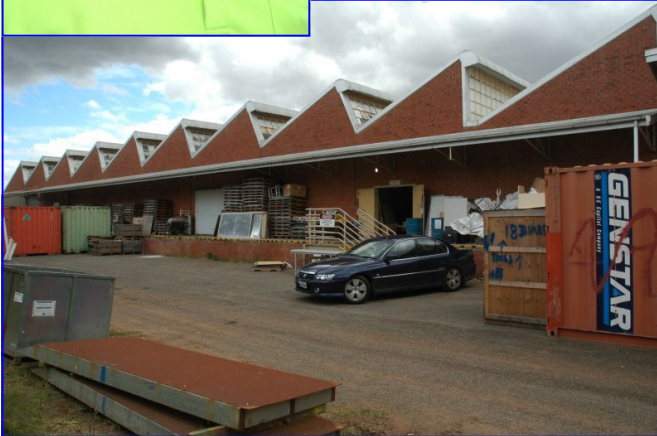
The main warehouse which is full of goods for sending