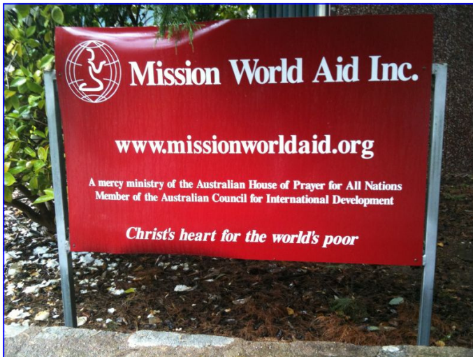
New sign outside the Mission Shed

Our landlord for the Stirling Mission Shed, ETSA Utilities have informed us that they will require the property from 6 September 2012 to establish a new sub-station on the site.