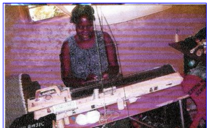
A widow knitting clothes for sale with a knitting machine